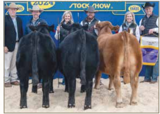
2024 NWSS CHAMPION LIMOUSIN PEN