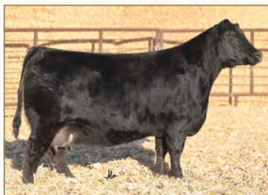
CNOC GEMINI 90G • Dam of Lot 5