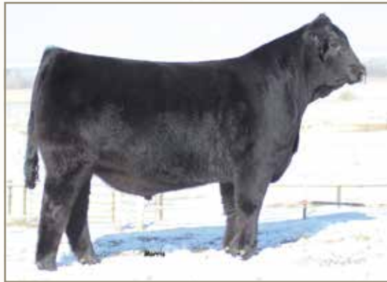
MAGS AVIATOR • Maternal grandsire of Lots 26 & 27