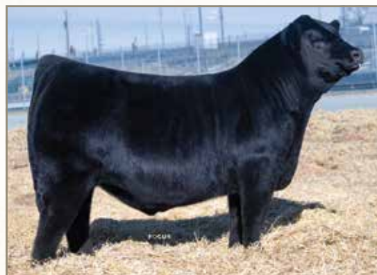
OLIM KEYSTONE • Maternal brother to Lot 1