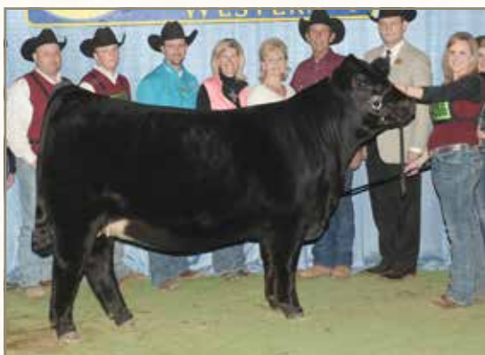
AUTO AMERIE • Great grandam of Lots 1 & 2