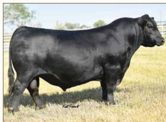
DB ICONIC G95 • Sire of Lot 5