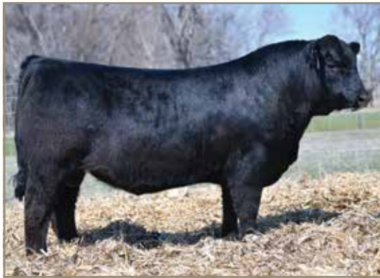
WULFS GAMEBOY • Sire of Lot 3